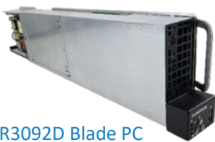
R3092D Blade PC